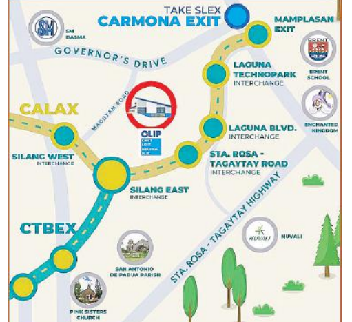
Easy access: Cavite Light Industrial Park strategic location gives locators easy access to the Port of Manila and Port of Batangas via SLEX and the ongoing developments of CALAX and CTBEX. to the company's inventory with high confidence that these will not be in the market for long.

they have recently opened the third phase of CLIP, which has received very good response from locators, including manufacturing, assembly, and warehousing clients. With the high take-up of the recent two tranches of CLIP Phase 2, an additional nine lots were added and these lots were sold out in about six months' time. Since then, 15 more lots were added