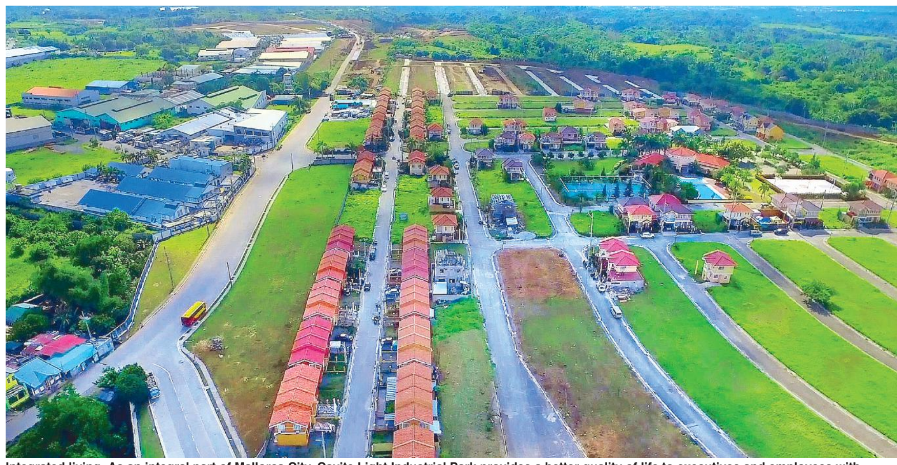
Integrated living: As an integral part of Mallorca City, Cavite Light Industrial Park provides a better quality of life to executives and employees with the township is residential and commercial components.

tory of CLIP can be used either exclusively an average of P8,500 per sqm. with lot cuts ranging from 2,000 to 4,000 sqm., lots at CLIP provide a high value for money compared to their Metro Manila counterthe P100,000 per sqm.