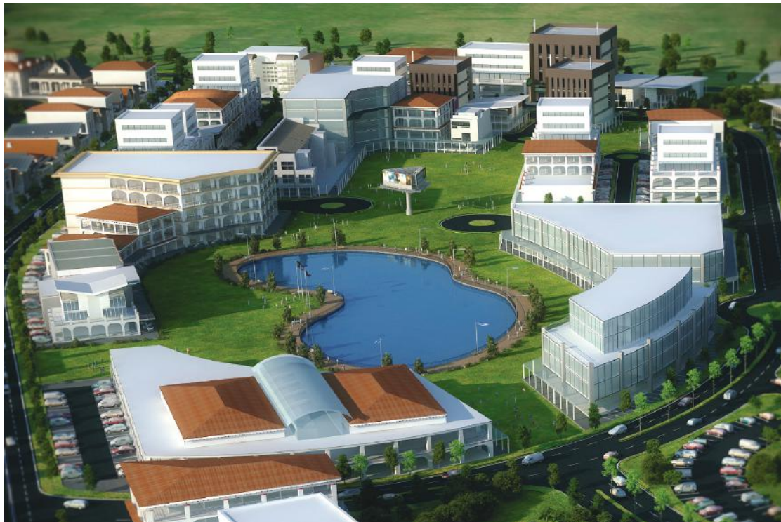
The commercial district of Westborough Town Square Center provides utmost convenience and accessibility to the residents of South Forbes Golf City. Whether you need groceries or a place to unwind, there’s no need to leave the confines of the township anymore.