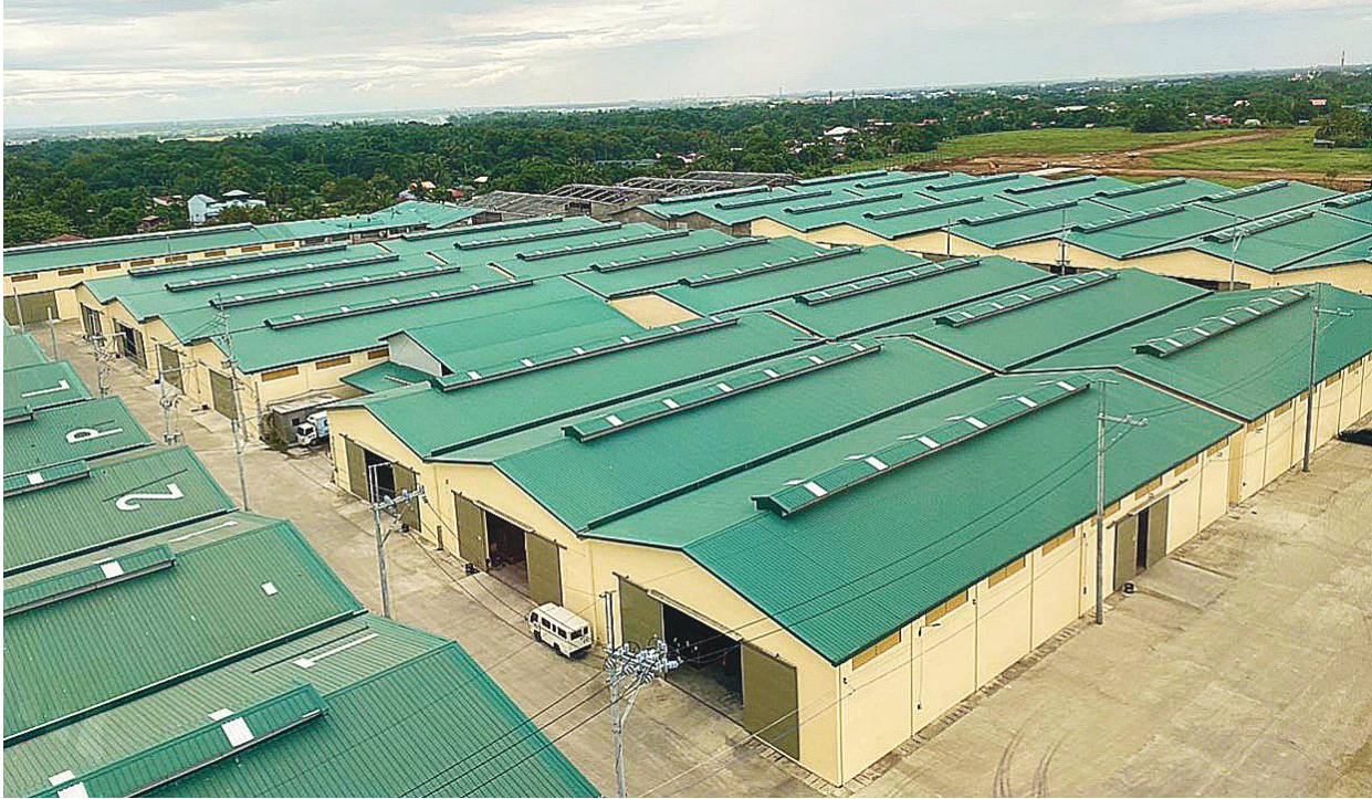
T12 Polo Land Inc., an emerging logistics player, is strategically located in Guiguinto, Bulacan, approximately five minutes drive from NLEX.

As of the first quarter of the year, existing logistics stock in the Philippines stood at 1.7 million sqm. Dry storage make up 66 percent of the existing supply, while cold storage and cold and dry storage contribute