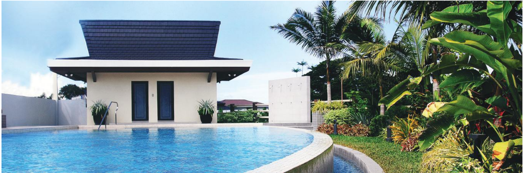
Rest and relax by The Racha Mansions’ pool and clubhouse. Let the tranquil sound of the infinity pool and luscious greens take you to paradise.