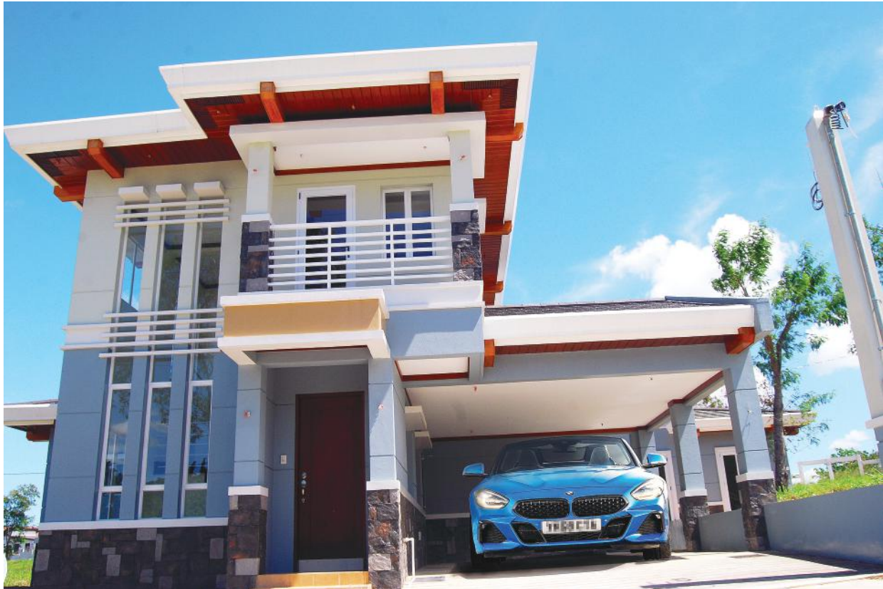
The Sukhothai at The Racha Mansions features timeless Thai-inspired architecture and colors that will capture the attention of any property seeker.

“People appreciate Thai-inspired architecture for its clean features and aesthetic. It’s very Asian, modern and whether it’s the clubhouse or front gate of the subdivision, you can see a distinct Thai theme of architecture or design.