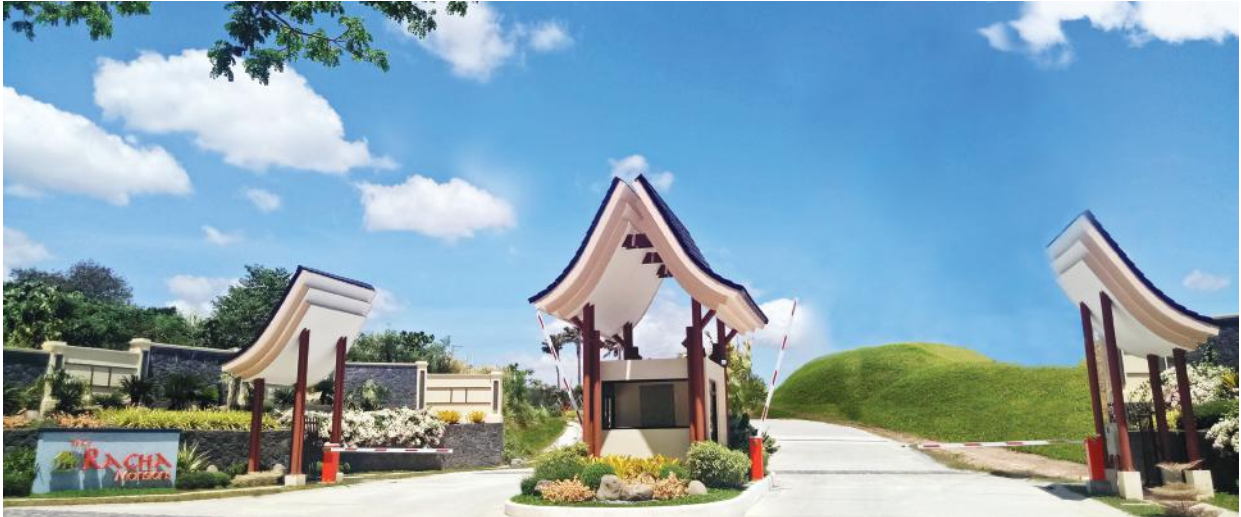
The Racha Mansions’ main gate balances security and style as it welcomes you home.

Aspiring homeowners may know more about The Racha Mansions by sending an email to info@southforbes.com or calling Cathay Land through (+632) 8635-7777.