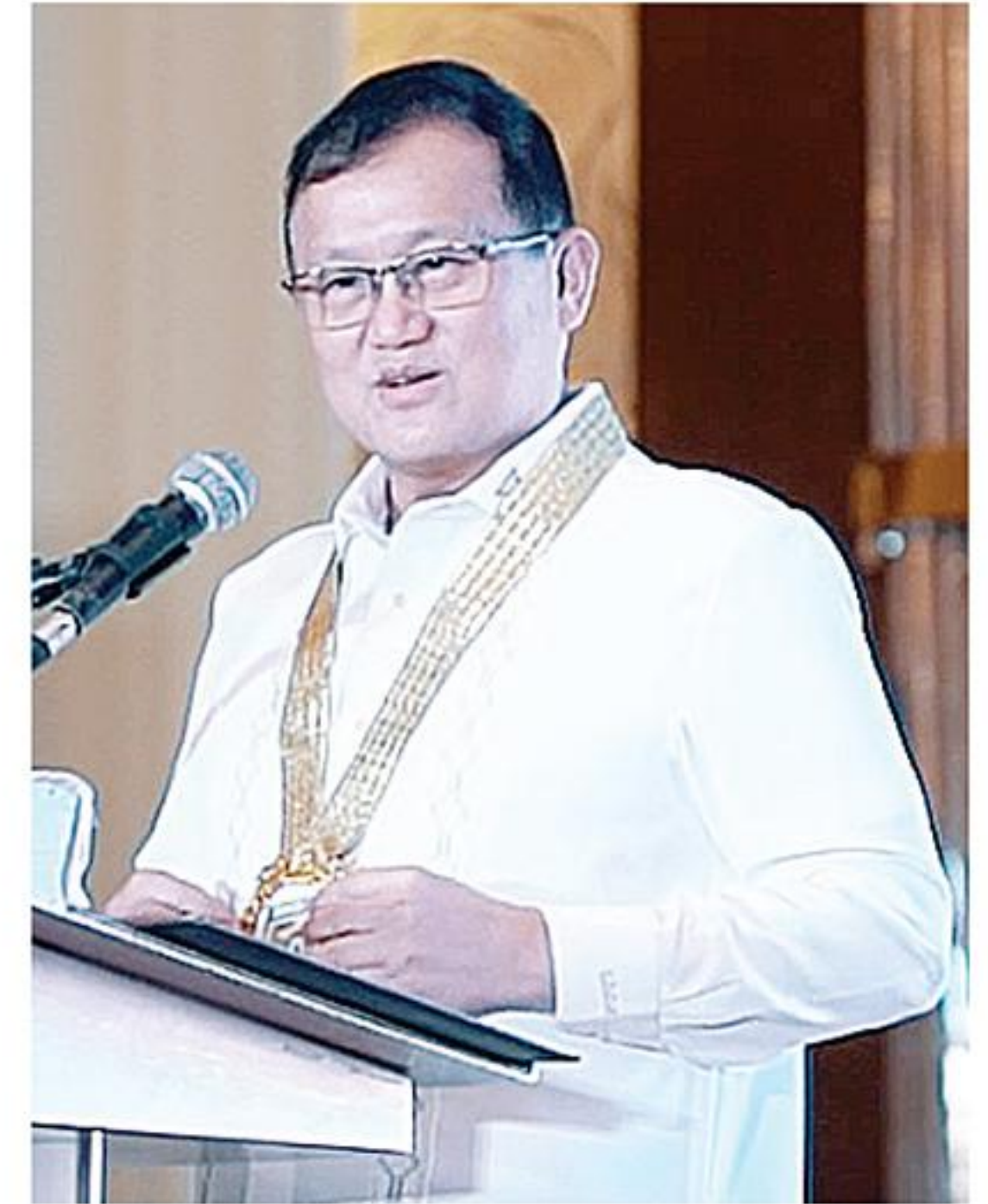
DHSUD Sec. Eduardo del Rosario

"Yes, we need the BBB program but we also want them to realize that the quickest