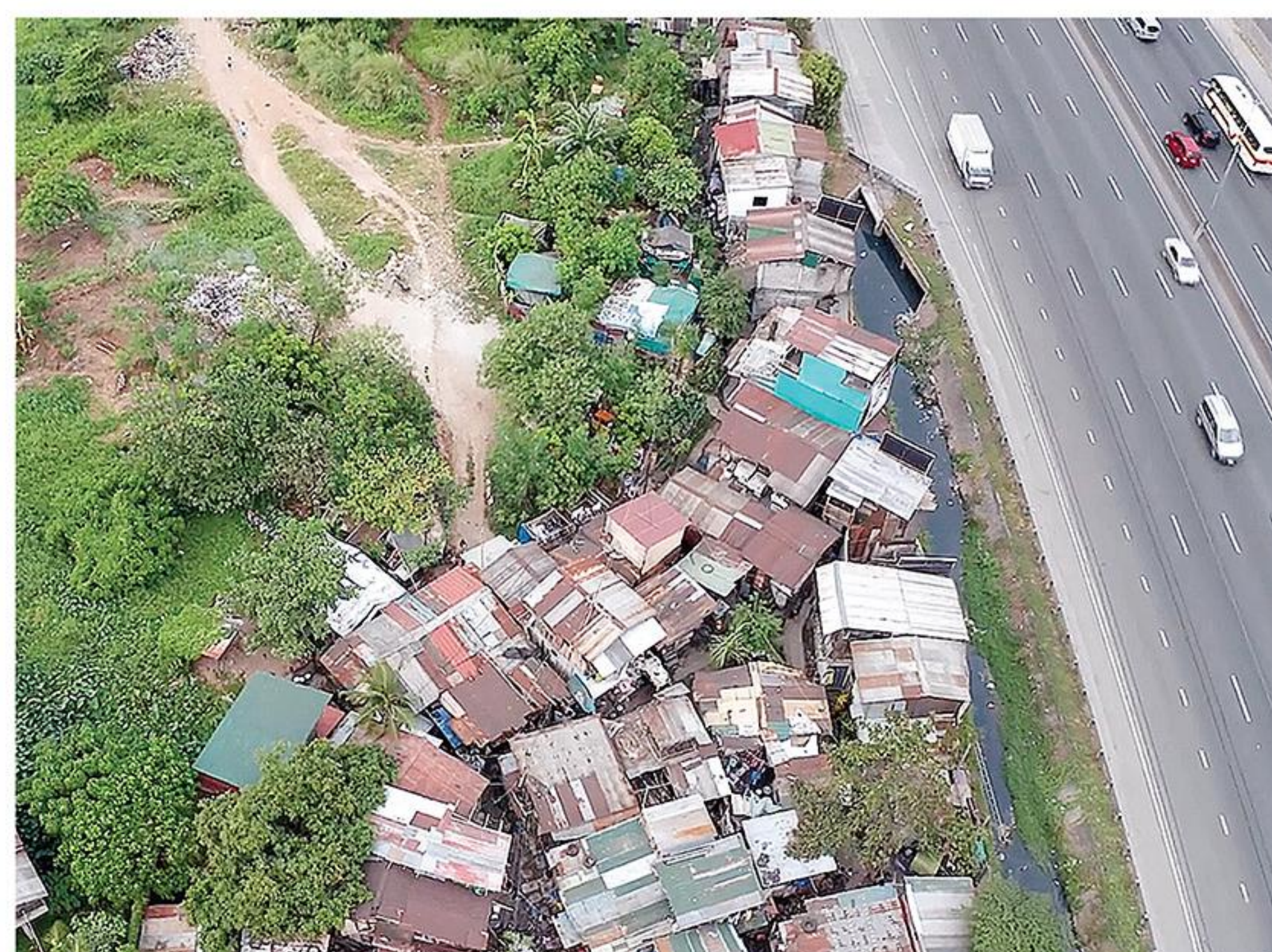
With a housing backlog of 6.5 million — and rising, SHDA wants to ensure that Filipinos have a home they can call their own.

"Housing is not just a major contributor to any economy, it is a key responsibility of, and a measure of, any government's service level to its people, and SHDA stands ready to work with government, hopeful that the right priority and attention will be given, in overcoming the bureaucratic and technical obstacles in the way of our giving every Filipino the home they and their family needs and deserves," he capped.