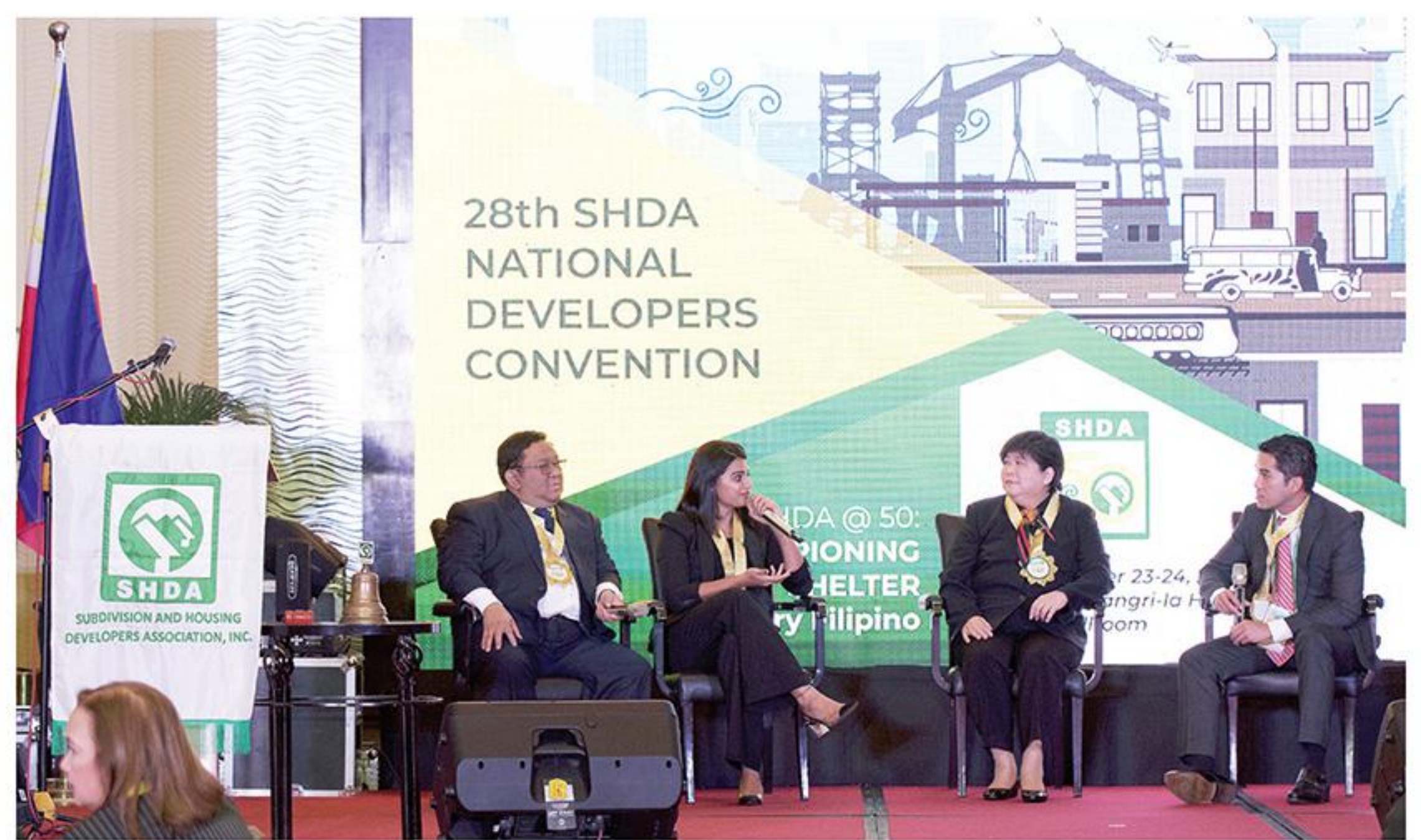
Panel discussion during the 28th SHDA National Developers Convention