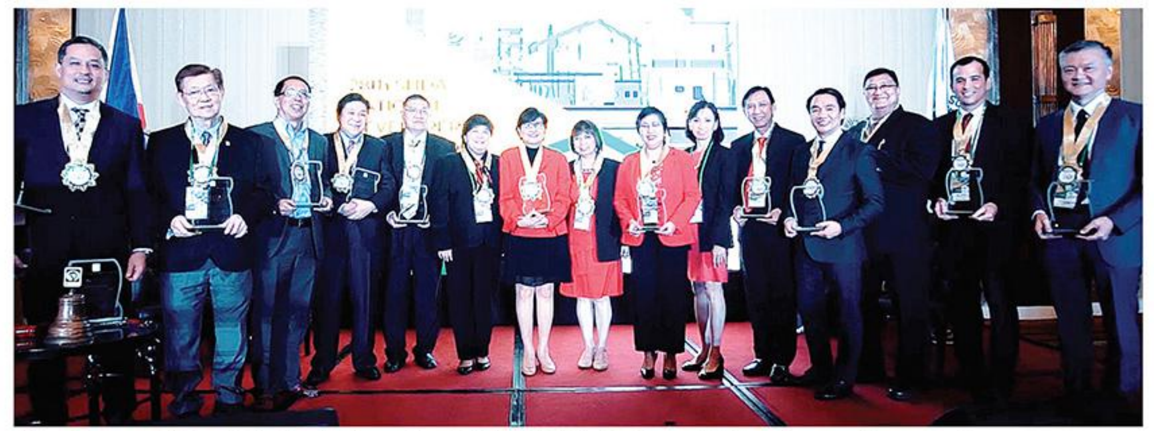
Members of the SHDA during the 28th SHDA National Developer Convention